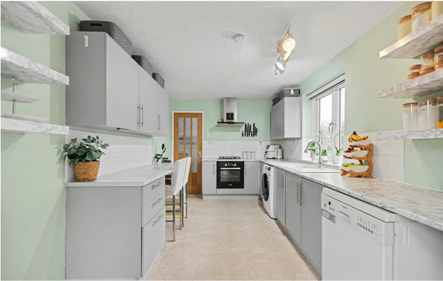
A well-presented and maintained extended, three-bedroom semi-detached house.

Benefitting from a large single storey extension to the rear, providing a large bathroom and breakfast kitchen, this great property has been upgraded during the current vendors occupation and now offers a ready to move into contemporary living space.